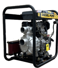
TRANSFER PUMPS WATER MOVERS